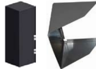
Pole Top Adaptor House Side Shield